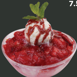
Bingsu Strawberry Diced strawberries, strawberry syrup and vanilla ice cream 8.5