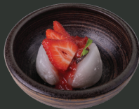
Strawberry Ve Vegan rice cake filled with sweetened red bean, served with strawberry 4.9