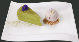
Matcha Mille Crepe Cake A delicious twist on a traditional French pastry. Thin layers of green tea crepes, stacked together with fresh whipped cream in-between. Served with red bean ice cream 9.5