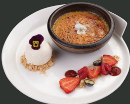
Kong-Galu Crème Brûlée Korean-style crème brûlée served with vanilla ice cream 8