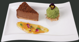
Choco-Yuzu Basque cheesecake Caramelised burnt basque cheesecake with choco and light citrus flavour. Served with green tea ice cream and yuzu jam 9.8