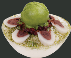
Bingsu Nogucha White mochi, sweet red bean paste and matcha ice cream 7.5