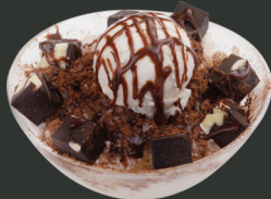
Bingsu Chocolate Brownie Chocolate brownie pieces, chocolate sauce and vanilla ice cream 7.5