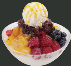
Patbingsu A popular Korean shaved ice dessert -served with mixed fruit, sweet red bean and vanilla ice cream 8.5