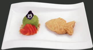
Bungeo-Ppang Fish-shaped pancake with sweetened red bean paste, served with green tea ice cream 8