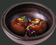
Chocolate Traditional soft rice cake filled with chocolate and a light dusting of cocoa powder 4.5