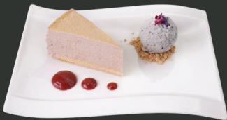
Strawberry Mille Crepe Cake Layers of light and soft crepes with whipped cream and strawberry puree. Served with black sesame ice cream 9.8