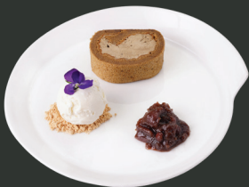
Hojicha Tea Roll Cake Rich in roasted tea flavour, light, airy and spongy, and filled with a hojicha cream. Served with vanilla ice cream and cherry compote 9