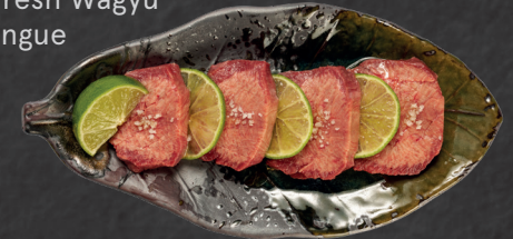
와규 소고기 혀 WAGYU TONGUE Sliced fresh Wagyu beef tongue 24