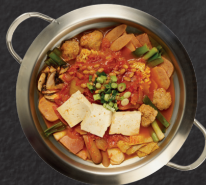
부대찌개 BUDAE JJIGAE 32 Spicy kimchee hotpot with ham, bacon, seasoned pork mince, sausage, tofu, ramen noodles, baked beans, spring onions and mushroom