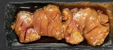
간장 닭 불고기 BULGOGI MILD CHICKEN 18 Signature chicken thigh Bulgogi with in-house Bulgogi soy sauce