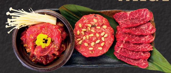
모듬바베큐 WAGYU MIX BBQ PLATE • Wagyu Harami • Wagyu Tteok Galbi • Wagyu Bulgogi 48