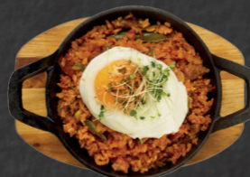
Wagyu beef Kimchee Bokkumbap 18