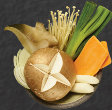
Assorted Veg 7.5