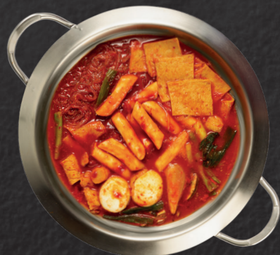
떡볶이 TTEOK BOK GI 28 Original Spicy / Black Bean / Curry Chewy rice cakes cooked in a pot and served with fish cakes, boiled eggs, glass noodles, mushrooms and spring onions