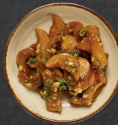
Homemade mooli pickles 5.5