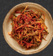
Scallion salad 6.5