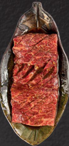
와규 소고기 갈비 WAGYU GALBI Wagyu beef rib marinated in in-house Galbi sauce 34