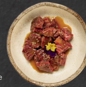
미소 와규 소고기 갈비 MISO WAGYU RIB FINGER Cut Wagyu beef rib marinated with in-house miso sauce 28