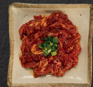
매운 돼지 불고기 DOEJI PORK BULGOGI 18 Signature pork belly Bulgogi with our in-house spicy sauce