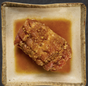
돼지 갈비 DOEJI PORK GALBI Pork belly marinated with in-house Galbi sauce 20