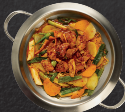
매운 닭갈비 CHICKEN DAK GALBI 32 Stir-fried chicken in Gochujang based sauce with sweet potato, cabbage, spring onion and rice cakes