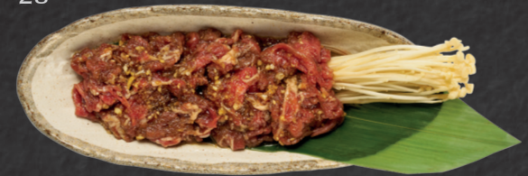
소불고기 WAGYU BULGOGI Thinly sliced Bulgogi marinated with in-house Bulgogi soy sauce 28