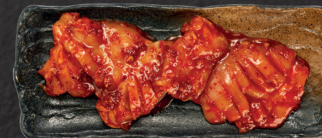
매운 닭 불고기 BULGOGI SPICY CHICKEN 18 Signature chicken thigh Bulgogi with in-house spicy sauce