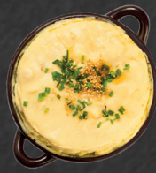
Organic savoury egg soufflé 7.5