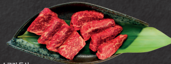
와규 소고기 등심 WAGYU LOIN & HARAMI Freshly sliced Wagyu beef loin and bavette steak 42