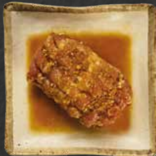
DOEJI PORK GALBI Pork belly marinated with in-house Galbi sauce 20