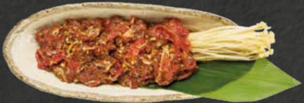
소불고기 BEEF BULGOGI Thinly sliced Bulgogi marinated with in-house Bulgogi soy sauce 28