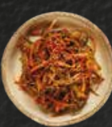
Spring Onion Salad Ve 6.5