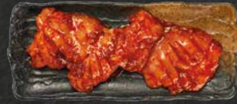
매운 닭 불고기 BULGOGI SPICY CHICKEN Ve 18 Signature chicken thigh Bulgogi with in-house spicy sauce