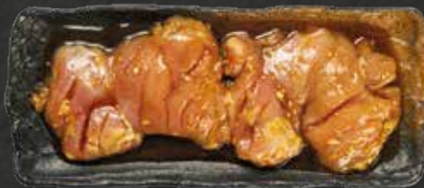
간장 닭 불고기 BULGOGI MILD CHICKEN 18 Signature chicken thigh Bulgogi with in-house Bulgogi soy sauce