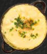
Traditional Savoury Egg Soufflé 8