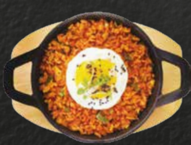
와규 소고기 김치볶음밥 WAGYU BEEF KIMCHEE BOKKUMBAP Ve 13.5