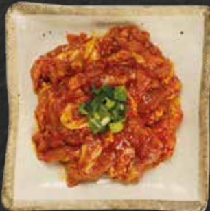
매운 돼지 불고기 DOEJI PORK BULGOGI Ve Signature pork belly Bulgogi with in-house spicy sauce 18