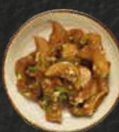
Homemade Mooli Pickles Ve 3.5