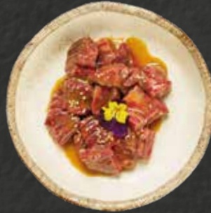
미소 와규 소고기 갈비 MISO BEEF RIB FINGER Cut Wagyu beef rib marinated with in-house miso sauce 28