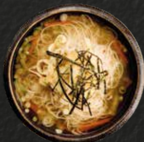
잔치국수 SAVOURY JANCHI NOODLE SOUP 8.5