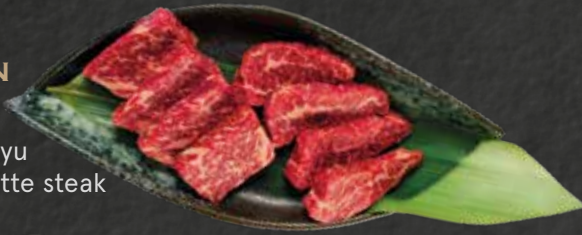
와규 소고기 갈비 WAGYU BEEF GALBI Wagyu beef rib marinated with in-house Galbi sauce 34