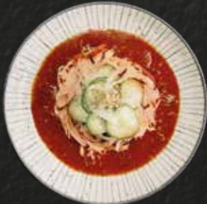
비빔면 SPICY BIBIM NOODLE Ve 8.5

Add noodles to your set at a special price (Discount applies to select items)