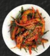
Cucumber Muchim Ve 6.5