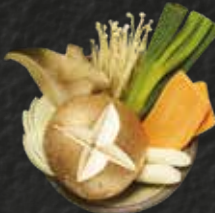
Assorted Veg Ve 7.5