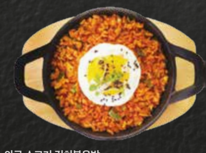
와규 소고기 김치볶음밥 WAGYU BEEF KIMCHEE BOKKUMBAP 13.5