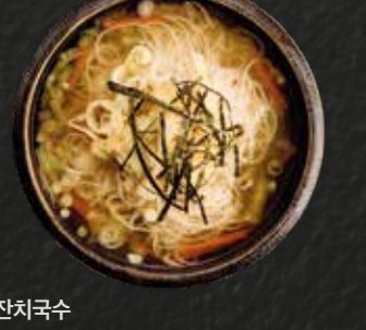
SAVOURY JANCHI NOODLE SOUP 8.5