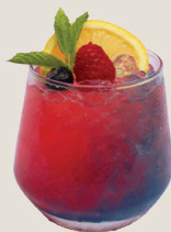
Kimchee Korea 8.5

Passionfruit Jasmine Lemonade Butterfly Tea