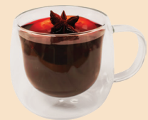
Korean Mulled Wine 8.5 Rich mulled wine infused with Korean Jujube and cozy spices