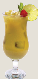
Green Breeze 8.5

Pear Ginger Apple Jasmine Grapefruit Soda