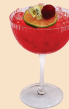
Soju Red Daiquiri 13.5 Don Q Cristal Rum Soju Fresh Raspberry Hongcho