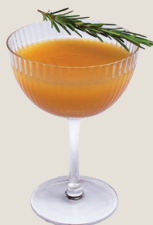
Gangnam Gimlet 13.5

Kinahan's KASC Whiskey Bokbunja Angostura Bitters