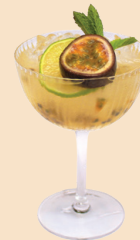
Golden Mezcal 13.5 Ojo De Dios Mezcal Passion Fruit Jasmine Lime