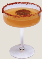
Kimchee Spicy Marg 13.5

El Rayo Tequila Triple Sec Lime Kimchee spiced honey