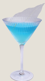
Jeju Island 13.5

58&Co Apple & Hibiscus Gin Pear Honey & Lime