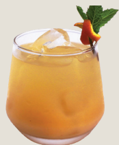
Ginger Maru 8.5

Pear Ginger Apple Jasmine Grapefruit Soda