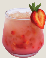
Ddalgi Danja 13.5

Mikolasch Vodka Kwaifeh Hongcho Lychee Pomegranate