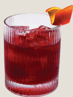
Bokbunja Fashioned 13.5

Don Q Cristal Rum Makgeolli Strawberry Honey & Lime